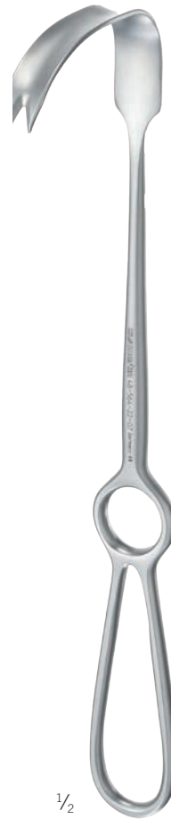
48-565-35-07 St 1 Retractor 14.5 cm / 5 7/8"