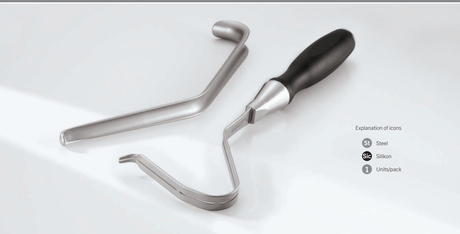
Retractors for mandibular border, Nadjmi